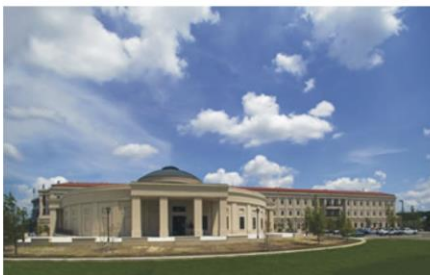
View of Energy, Coast & Environment Building from Nicholson Drive Extension